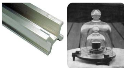
Figure 2.5.1: Meter standard (left) and Kilogram standard (right).

How long is a yard? It depends on whom you ask and when you asked the question. Today we have a standard definition of the yard, which you can see marked on every football field. If you move the ball ten yards, you get a first down and it does not matter whether you are playing in Los Angeles, Dallas, or Green Bay. But at one time that yard was arbitrarily defined as the distance from the tip of the king's nose to the end of his outstretched hand. Of course, the problem there is simple: new king, new distance (and then you have to re-mark all of those football fields).